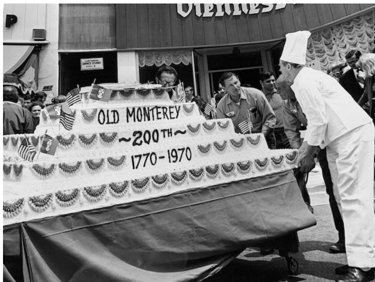
Monterey's 200 th Birthday Cake.