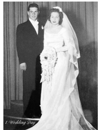
Wedding day, 1947.

president of the Junipero Serra School Mothers' Club,