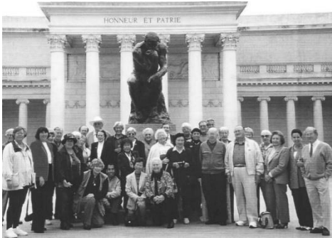
One of her tour groups in Paris.

She organized many religious trips to Europe and the Holy Land and Morocco through the Carmel Mission parish, and those travels took her all over the world.