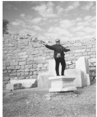
Right: Shalom Jerusalem.