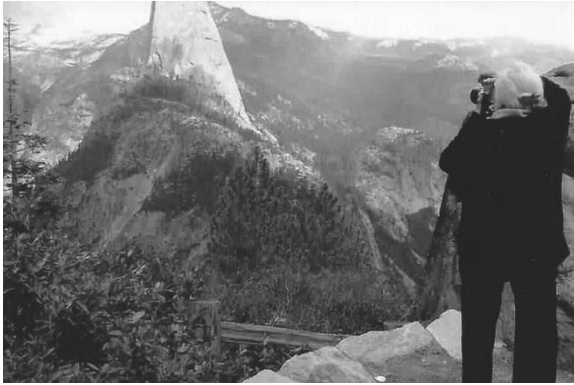
The Glory of God, Half Dome.

She was a stranger to no one and could often be found chauffeuring international tourists around her beloved Monterey Peninsula or sharing a cup of coffee with a new friend. She was known for her stories, her generous spirit and her love for everything, everywhere and everyone.