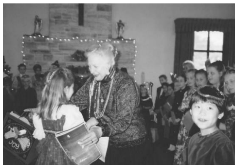
Faith Formation class.