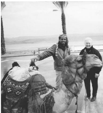
Left: Going to ride the camel.