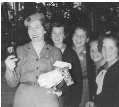
Girl Scout leader.