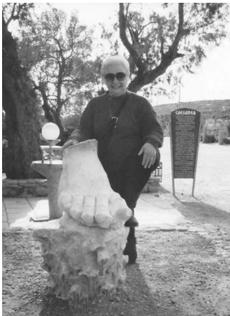
Left: Caesarea, Israel.

She organized many religious trips to Europe and the Holy Land and Morocco through the Carmel Mission parish, and those travels took her all over the world.