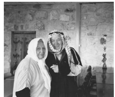
Right: West Bank, Israel.